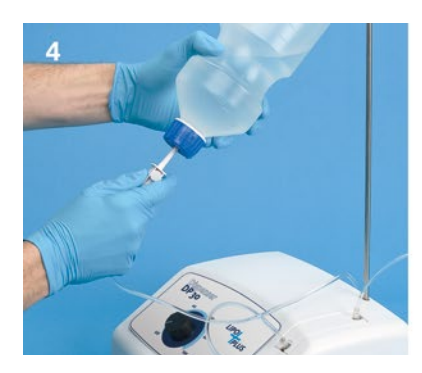
Insert the spike at the end of the tubing set into the infiltration fluid bottle and hang the bottle onto the stand.